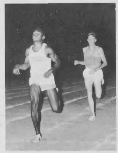
Track Race at Sport Park